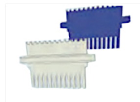
Combs with different colour codes for different thicknesses